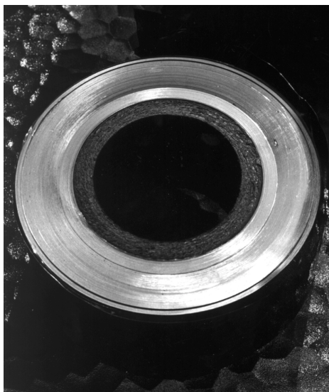
Use 3-inch wide, 3-mil copper foil to ensure a good sea water ground.

Same thing for a powerboat—but you'll need more ground foil because your automatic antenna tuner is probably mounted up top on the flying bridge. In this case, you will need to follow a wire run channel from the top of the flying bridge down below decks, and down to the bilge area where you can make connection to underwater through-hulls. You could even use a metal tube that may already be in place as part of your ground foil run.